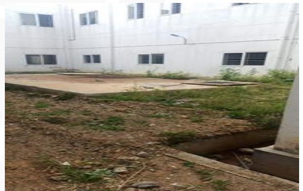
Rain Water Storage Units