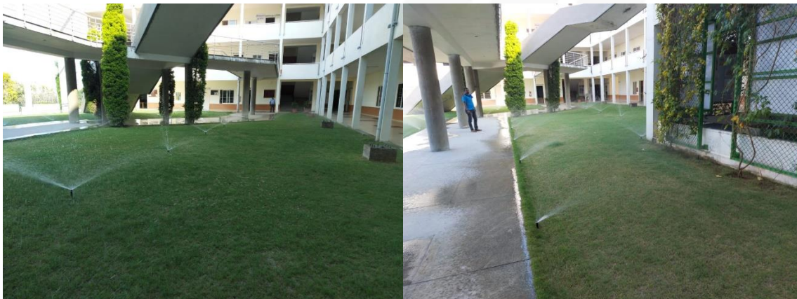
Reuse of Water for Gardening and Green Cover Development