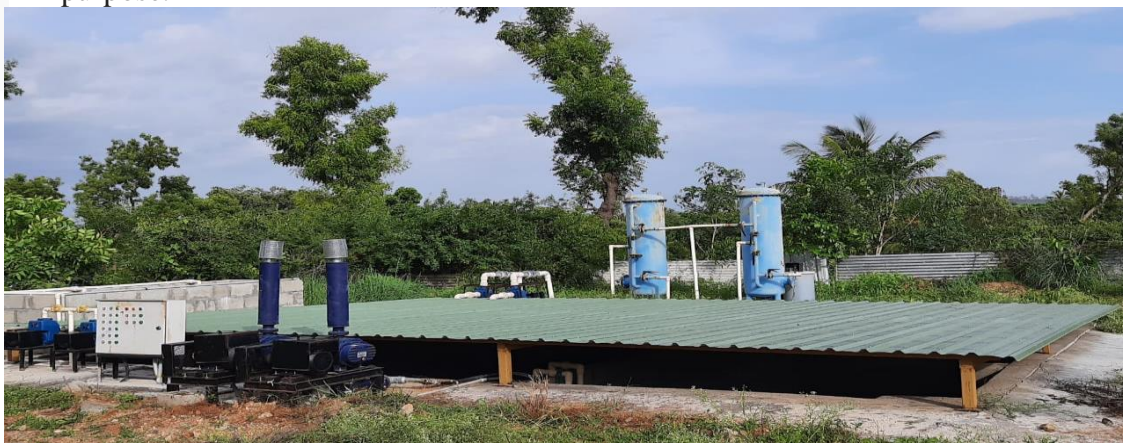
Sewage water Treatment plant located in ATME campus